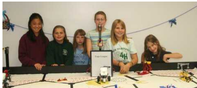
Team 1559: "Genius in Disguise" with their robot at the practice table.

new challenges and find ways to overcome them as a team.