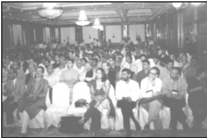
A Section of the audience at the dinner banquet