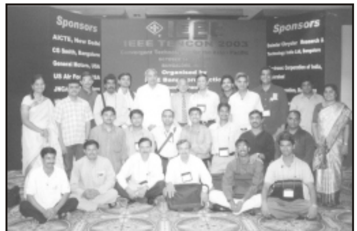
Some of the Tencon 2003 Committee and Volunteers