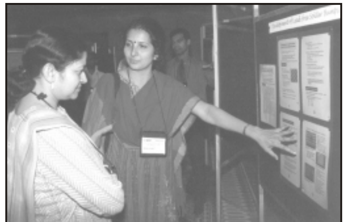
A poster session in progress