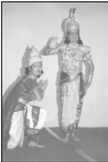
Cultural program at the dinner banquet