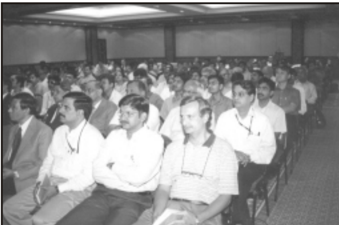
A section of the Inaugural audience