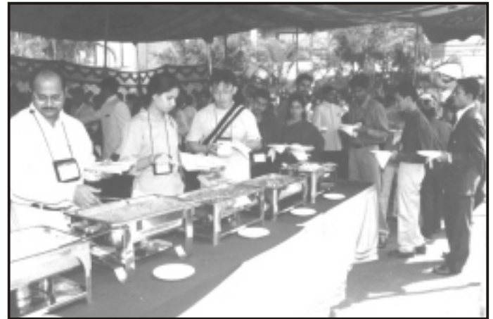
Luncheon in progress at the Conference