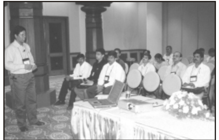
A typical paper presentation in progress