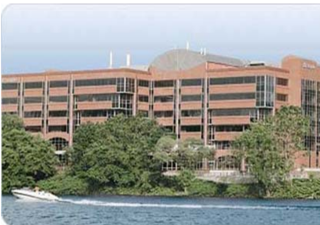
Seagate Research Center, view from the Allegheny River