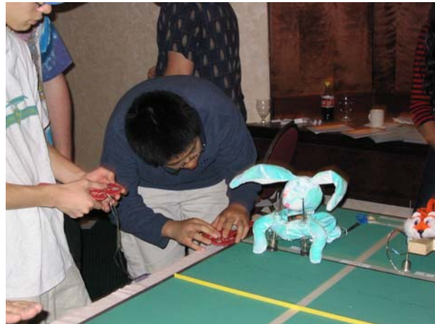
Here is the "Wabbit" at the starting line.

The robot "Psychotic Wabbit" got quite a workout in the competition, there were some problems but they were solved.