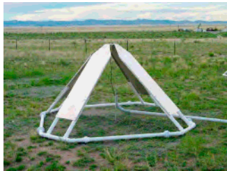
Low frequency antenna

Abstract: The Long-Wavelength Array (LWA) is a joint project of the University of New Mexico, the Naval Research Laboratory, the University of Texas at Austin, the Los Alamos National Laboratory, Virginia Tech, and the University of Iowa. The LWA will be an interferometric telescope operating in the 10 – 88 MHz spectral region. This wavelength range has been poorly exploited in the past because of the difficulty of imaging through ionospheric turbulence. New methods make possible a kind of adaptive optics approach that promises to enable observations of a quality comparable with higher frequencies interferometers. These methods will provide simultaneous images of celestial scenes and solutions for the fine-scale structure of the ionosphere. As a result, it will be possible to do a wide range of astrophysical problems, relating to the earliest phases of the universe, the evolution of radio galaxies, the structure of our own galaxy, the occurrence of transient radio emitters, and the existence of exoplanets. It will also be possible to provide extremely precise structural information about the ionosphere on spatial and temporal scales not studied by current probes. In this presentation, we will discuss the broad scientific goals of the LWA, sketch out the technical plans for its implementation, and lay out some of the practical problems in executing the project.