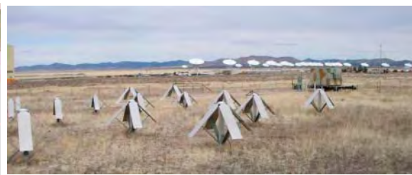
Long Wavelength Demonstrator Array