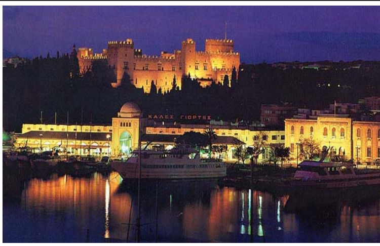
Rhodes the city of knights