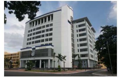
TA QUANG BUU LIBRARY BUILDING