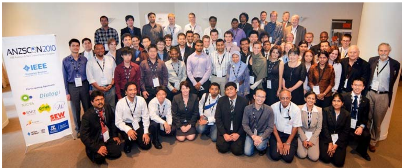
ANZSCON attendees and speakers in a group photo

Concurrently with the project/poster display competition, seven employer representatives from various engineering industrial sectors were on hand to answer questions students had about employment opportunities in their respective