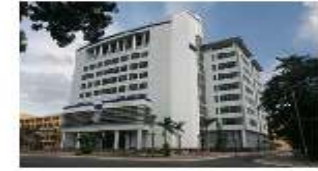
TA QUANG BUU LIBRARY BUILDING