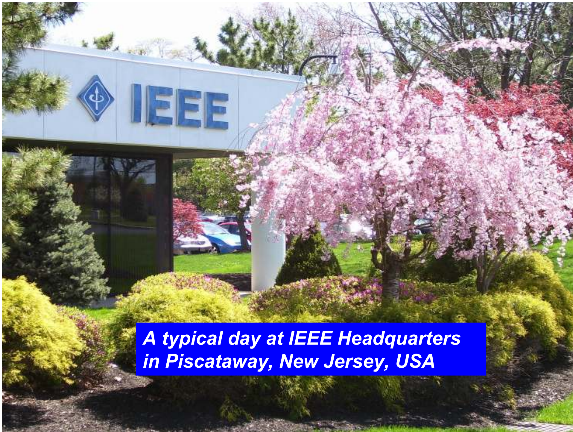
A typical day at IEEE Headquarters in Piscataway, New Jersey, USA