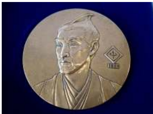
Photo 1 IEEE Kansai Section Medal

For that purpose, Kansai Section gives "the IEEE Kansai Section Medal" to new Senior Member and support an application for Senior Member grade on our web site.