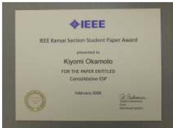
Photo 3 IEEE Kansai Section Student Paper Award

In 2004, we also established a new award for students, the Kansai Section Student Paper Award. This Award is for student members who have presented their excellent research results in IEEE international conference or IEEE Transactions. We selected 12 winners of this award in 2008.