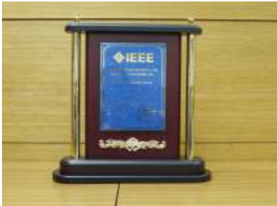
Photo 2 IEEE Kansai Section GOLD Award