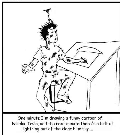
One minute I'm drawing a funny cartoon of Nicolai Tesla, and the next minute there's a bolt of lightning out of the clear blue sky....