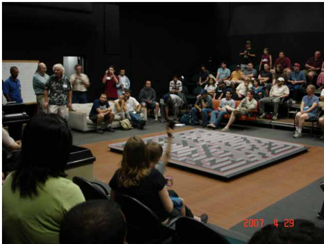
The heat of competition

All of our category scoring was relative. The measurements were rank ordered and the top three contestants received 5, 3, and 1 points – or, 3, 2, and 1 points, depending on the category weighting. The rest of the contestants received zero points. The final, overall scores ranged from 4 points to 18 points, with the top three finishers scoring 18, 14, and 13 points. We had clear Win, Place, and Show finishers. For the next couple of hours, we got to sit back and enjoy the Maze Competition.