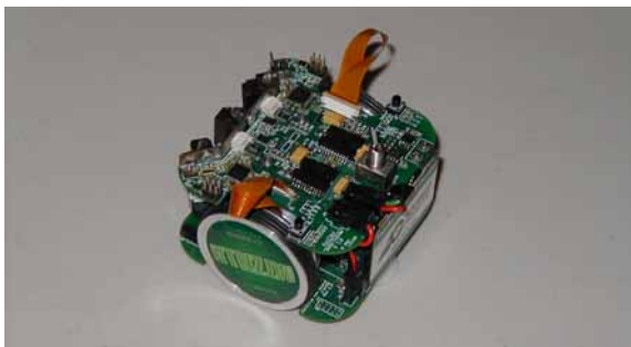
The overall Winner of both Maze and Best Packaging, Rat-Zilla from UC-Davis

The meeting reconvened back in the original meeting room for the awarding of the prizes. The Maze winner was the UC-Davis team with Rat-Zilla – successfully navigating the maze in 38.9 seconds on its first attempt! Interestingly, the same UC-Davis team won the Maze Competition in Fresno in 2006. Could this be the start of a dynasty? To the surprise of the attendees – and to the teams – Rat-Zilla also took the Best Packaging Prize with Juanito 5 Jr. and Ramrod taking second and third. Rat-Zilla excelled at having the smallest volumetric envelope, lowest RF emission, and the second-lowest audible noise level. Rat-Zilla was unique in its use of AC pancake motors (used in magnetic disk drives) for its main drive. These motors were exceptionally quiet and very fast. Many of the other contestants used noisy stepper motors to move the Micromouse from square-to-square in the Maze. Also, the UC-Davis were the only team to “brand” their Micromouse with the Rat-Zilla name and UC-Davis emblazoned on the unit – thus earning themselves sole points for Product Design Markings. With First Place in the Maze competition and the Best Packaging award, the UC-Davis team went home with an extra $1,000 for their student chapter.