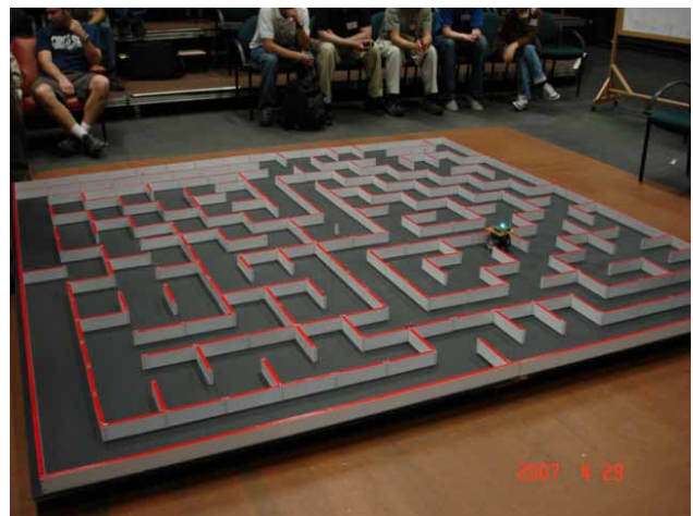
A practice run through the Maze