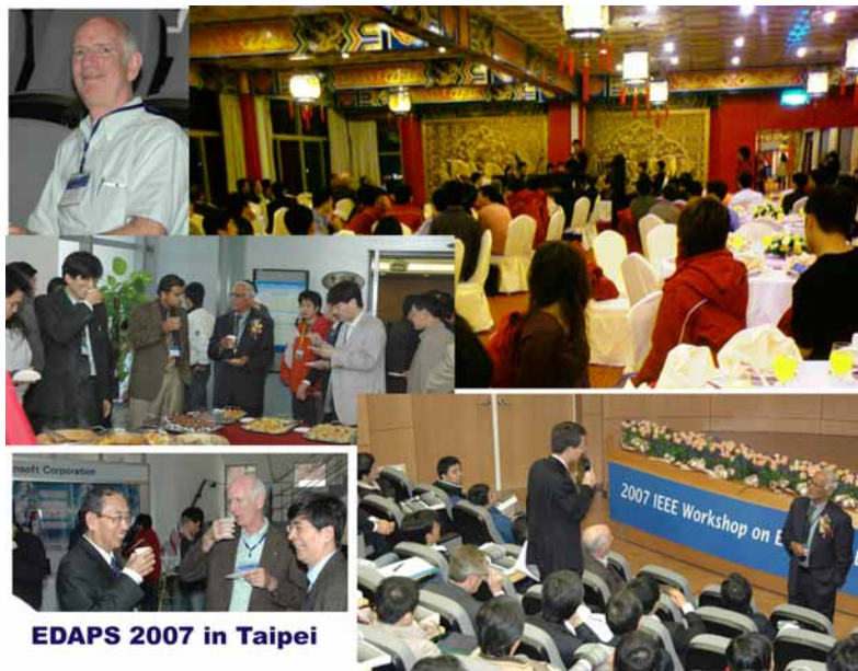
EDAPS 2007 in Taipei