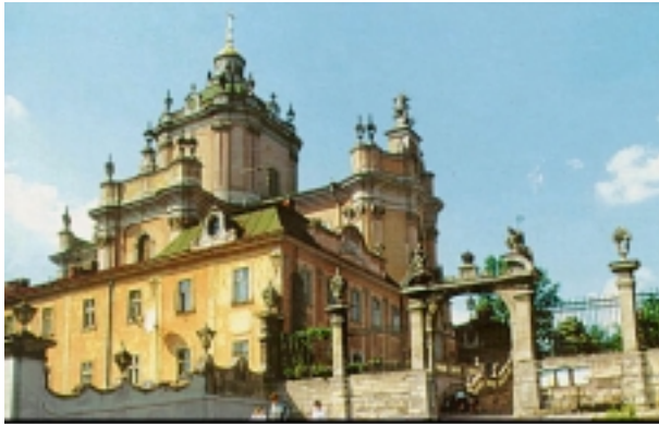
Lviv. The Ukrainian Yura cathedral

Katedralna (Cathedral) Square with a magnificent building of Latin Cathedral is adjacent to the south west corner of Rynok Square. The construction of the cathedral began in 14 th century and lasted more than 100 years. The interior of Latin Cathedral amazes by its lancet Gothic arches, narrow stained-glass windows, lavish carvings of its altars and wall frescoes.