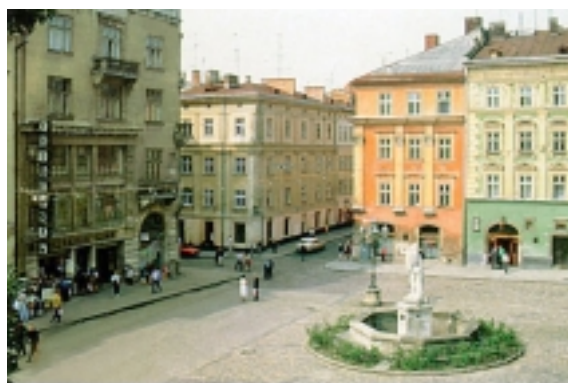
Lviv. Rynok Square (the Grand Place in Ancient Lviv)

Rynok Square (or Market Square), the heart of trade, administrative and social life of those times was located in the centre of this "city within the walls". In the medieval times this square was a place of a lively trade. Stone scales, pillory and a pool with fish for selling were also on the square. The middle of the square has always been a site for a house of the city government, the City Hall. On its perimeter the square was densely built up with three-window stone buildings. Every house had its own, unique history. The oldest ones that have preserved their original design are in the style of Renaissance: "the Black House", Korniakt's Palace with wonderful Italian Yard inside it.