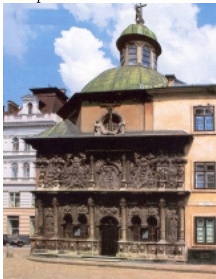
Lviv. The Boim's Chapel

Lviv is the biggest cultural and industrial center of Western Ukraine. For its quick development Lviv thanks its profitable geographic location on the Roztochya area (Baltic-Black Sea line). The population of Lviv is 830,000. The city is located on the cross of the most important transport ways, which connect Ukraine with the other European countries. This makes Lviv favorable for both tourism and business.