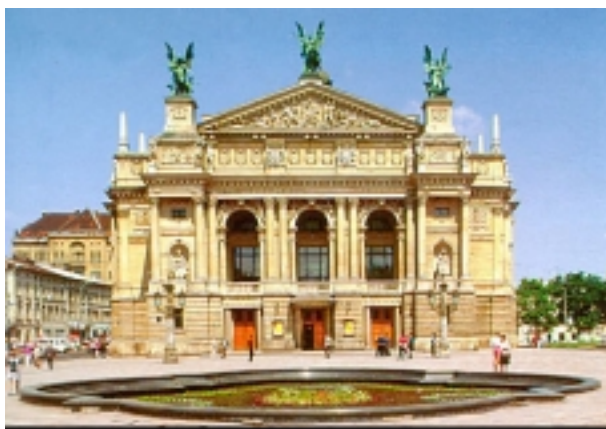
Lviv. Opera house

“Austrian Period” (since 1772) in Lviv architecture was marked by extension of city borders outside the city fortifications, formation of new residential districts along ancient trade roads. Medieval ramparts were demolished and replaced by parks and boulevards. The Opera House built in 1897-1900 by Z. Gorgolewski is a vivid example of that period.