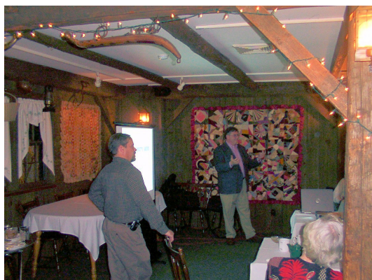
Speakers at the IEEE Berkshire Consultants Network meeting.